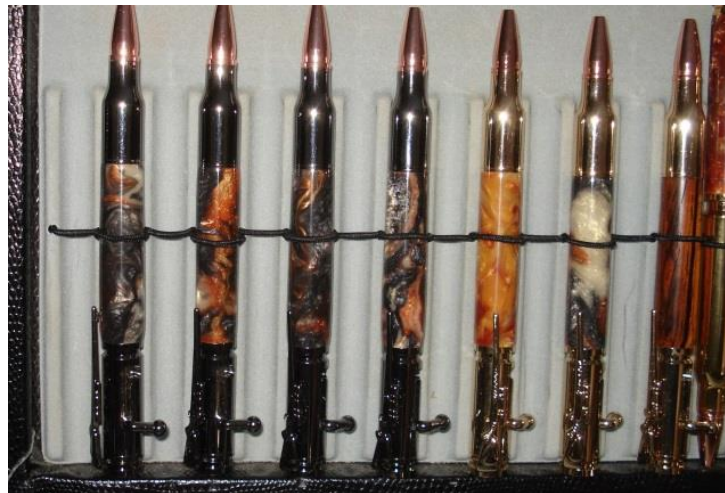
This is a great Pen to make and sell

Bolt Action Pens completed W/Earth Core Barrels